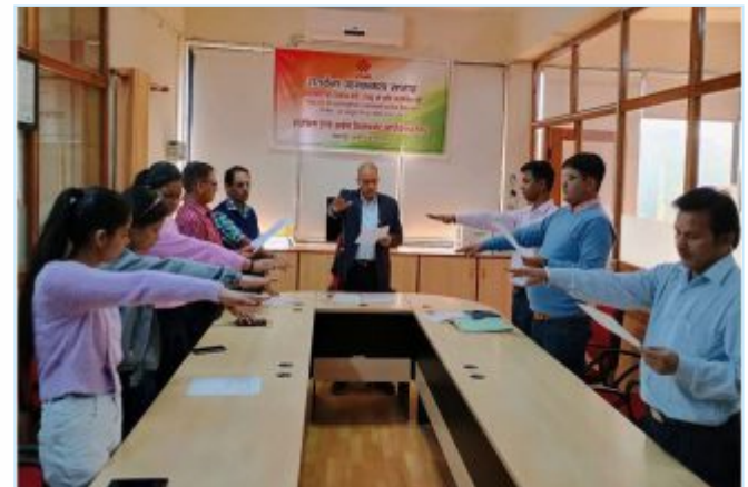
Dehradun Regional Office