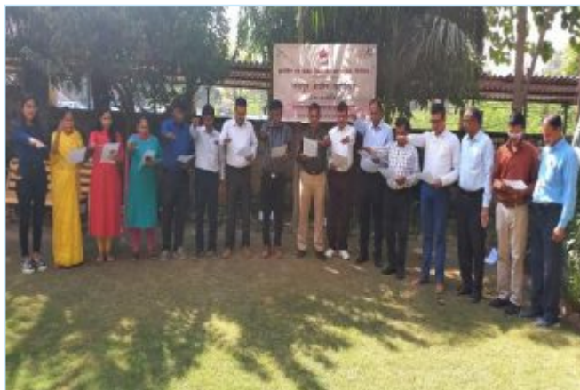
Jaipur Regional Office