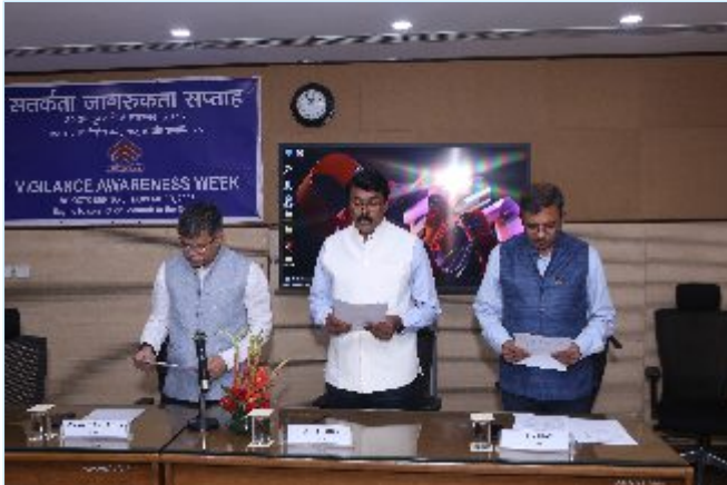
Corporate Office Delhi