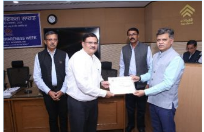
Corporate Office Delhi