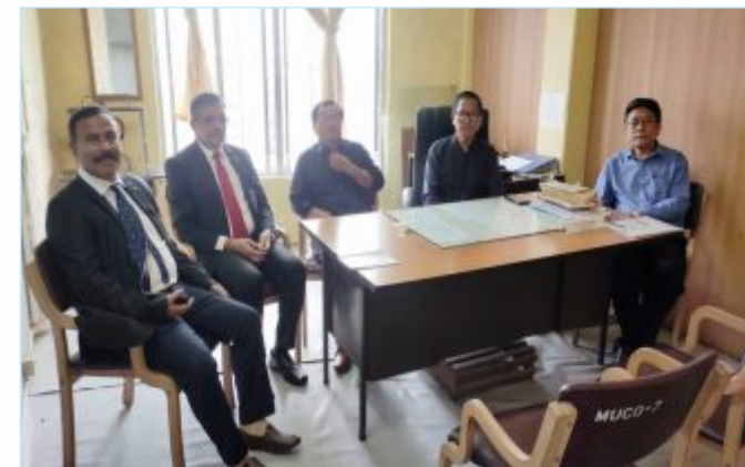
Meeting with Chairman, Secretary and CEO of MUCO Bank