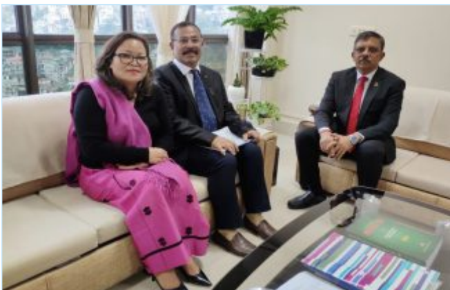
Meeting with Secretary Local administrative Department & District Council