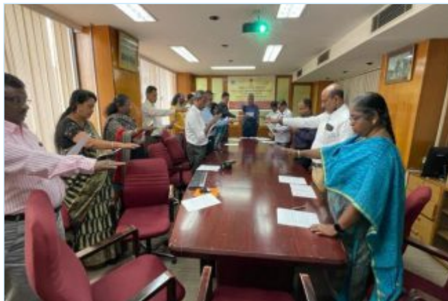
Bengaluru Regional Office