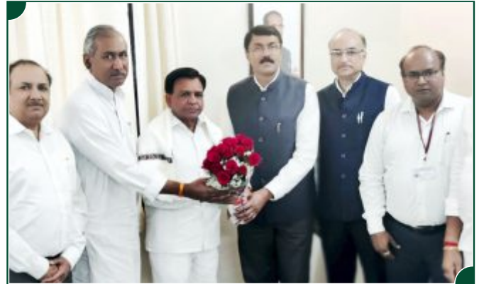
Hon'ble Minister of Finance Shri Jagdish Devra

A meeting with Hon'ble Minister of Finance Shri Jagdish Devra along with HUDCO's Independent Director Shri