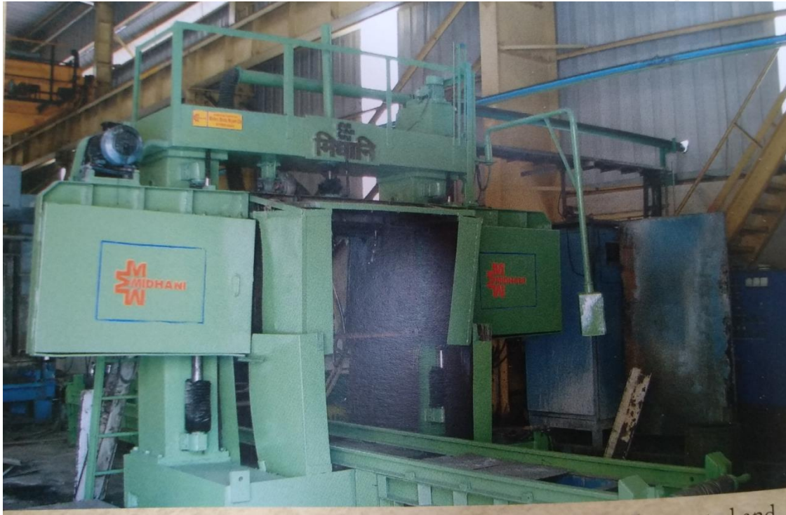
(Electric Discharge Cutting Machine)

MIDHANI Deigned Built Integrated and Commissioned Electric Discharge Cutting Machine two numbers with in house expertise