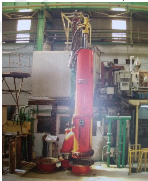
(20 T VAR)

Indigenously designed furnace and will cater to production of Titanium ingots & clean steels for Defence ,Space, Atomic Energy. This facility is dedicated exclusively for aerospace quality titanium products. The equipment was commissioned on March 26, 2016.