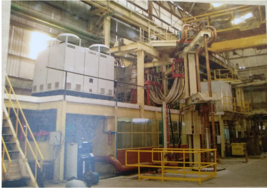
(20 T ESR furnace)

MIDHANI indigenously designed secondary refining furnace. This facility has balanced with primary melting of 20T EAF and caters to the present and future requirements of heavy Gun Barrels for Indian Ordnance. The Equipment was commissioned on December 1, 2015 . This facility has enabled MIDHANI to enter in to business of cast, forged & heat treated products for different steel grades weighing single piece upto 20 T