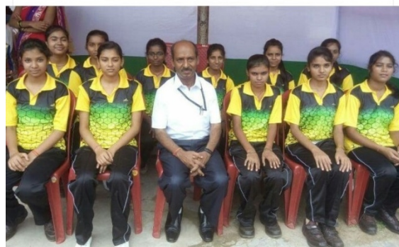
Social media post of Hon'ble Minister Shri Piyush Goyal

There's nothing like enlightening the lives of people from most vulnerable sections of society through education. Central Coalfields' initiative of preparing girls of weaker section for engineering entrance exam is a huge step in the direction of empowering the deprived.