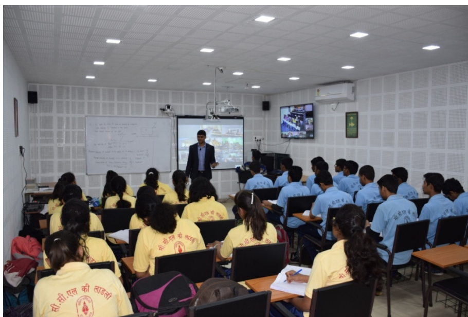
A well equipped class established for CCL Ke Lal and CCL Ki Laadli

The scheme was originally started as CCL Ke Lal with 11 boys in the year 2012 as CSR initiative. Since inception 5 batches of CCL Ke Lal have passed with flying colours. Students of CCL Ke Lal have performed extraordinarily in engineering entrance exams as well in XII board. Many students are presently studying in IITs, NITs and other premier institutes of the country.