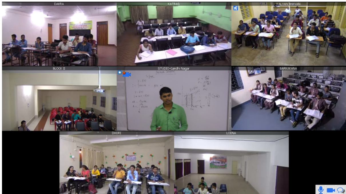
Coaching through Interactive Smart Classes at 7 remote locations

In 2017 coaching under CCL Ke Lal & CCL Ki Laadli was also started through video conferencing based live interactive smart classes in mining areas. Three such centres were setup in CCL and four in BCCL. Total number of seats increased to 388 last year. The interactive smart classes were inaugurated by Honble Minister of Rail and Coal Sri Piyush Goyal in Sep'2017.